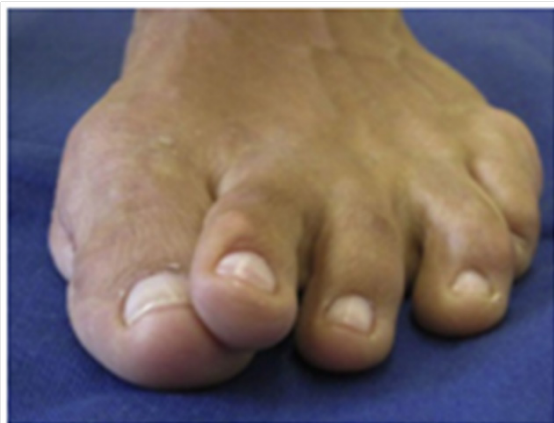
Figure 1 Typical appearance of a ruptured plantar plate with concomitant hallux abducto valgus deformity. Note the dorsal dislocation of the digit with a medial. 18

The second MTPJ is the most frequently affected with the incidence of this condition highest among women over the age of 50. 2 Interestingly, patients with rheumatoid arthritis tend to demonstrate plantar plate insufficiency at the fourth and fifth MTPJs more so than the second. 3 Other deformities are often present in conjunction such as hallux abducto valgus (Figure 1), hallux rigidus, and hallux varus. 4 This review will focus on plantar plate anatomy, pathology, and the diagnosis, treatment and outcomes of plantar plate tears.