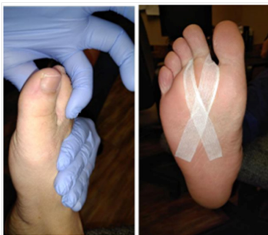
Figure 3a Demonstration of the Lachman's drawer maneuver with vertical stress applied to the proximal phalanx with one hand while stabilizing the metatarsal of the involved MTPJ with the other hand.

Plantar plate dysfunction can occur as a chronic, gradual disease process or more infrequently as an acute injury. Physical examination throughout the advancement of plantar plate disease changes drastically. Initially, patients may present with plantar sulcus pain, swelling at the MTPJ and no noticeable digital deformity. With time, digital dislocation, increasing deformity and intensifying pain characterize later stages. 4,9 A practitioner can use multiple exams to elucidate the diagnosis of plantar plate injury. A Kelikian pushup test, manual loading of plantar plate by applying direct pressure upon the metatarsal heads, should be performed and reveal reduction to the level of surrounding digits in a patient without plantar plate pathology. The Lachman drawer maneuver (Figure 3a) consists of applying vertical stress to the proximal phalanx with one hand while stabilizing the metatarsal of the involved MTPJ with the other hand; greater than 2 mm of dorsal displacement is significant. Additionally, the paper pull-out test, in which a thin strip of paper is placed beneath the pulp of the toe with the toe in plantarflexion. A positive test will reveal decreased strength in plantarflexion of the involved digit, resulting in a completely intact piece of paper pulled from beneath the digit. 2,4 These exams should be performed on contralateral foot for comparison.