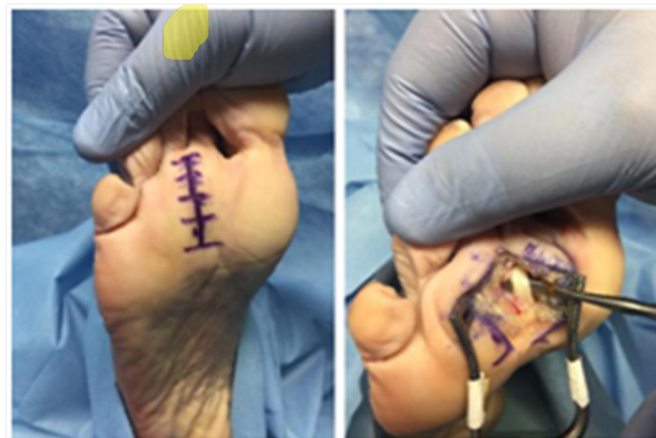
Figure 4a Linear plantar incision.

Conservative treatment depends on whether the injury is acute versus chronic. Early conservative treatment is recommended before any surgical intervention. Acute injuries can be treated with shoe modification, offloading, taping, anti-inflammatory, ice, elevation and compression. Injections are not recommended as they can mask symptoms and also weaken the plantar plate.