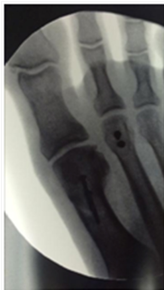
Figure 6 Weil metatarsal osteotomy with 2.0 mm screw fixation.

Upon adequate visualization of the plantar plate, a full thickness flap is created to allow for a mattress suture on proximal end of the plantar plate. Next, crossed tunnels are drilled on the proximal phalanx. The suture from the proximal end is passed from plantar to dorsal through the tunnels. Next, fixate the Weil osteotomy with 2 small screws (Figure 6). The sutures are tightened with the phalanx plantarflexed 15-20 degrees and tie sutures. Standard skin closure in layers is performed. The postoperative course is identical to what is described in the plantar approach description above.