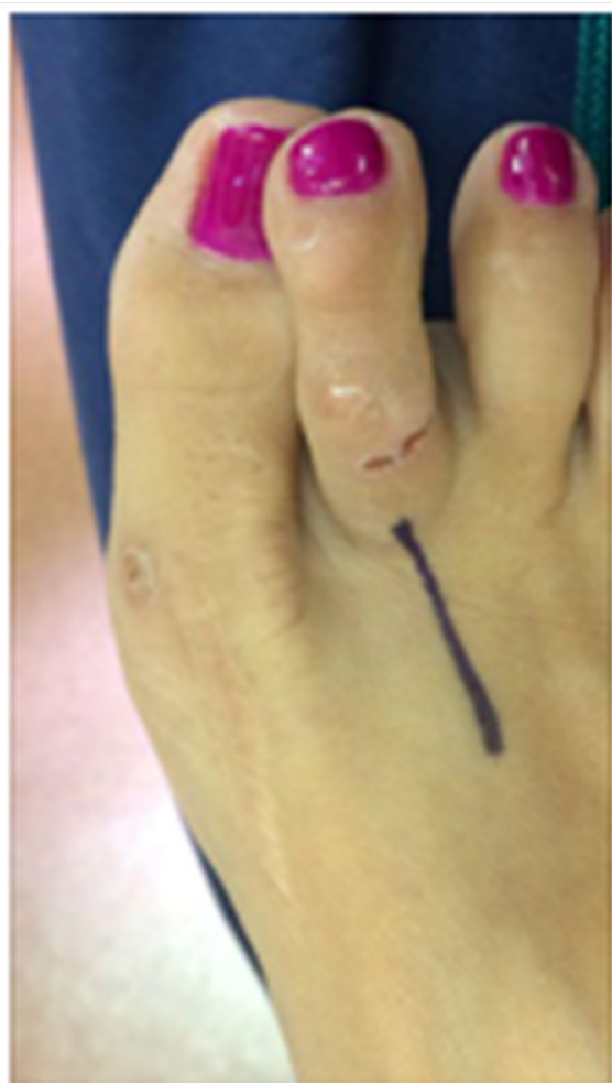
Figure 5 Incision placement for dorsal approach.

For the dorsal approach, a 3 cm linear incision is made either at the interspace or directly over the extensor longus tendon (Figure 5). Dissection is carried down to the extensor apparatus. A MTPJ capsulotomy is performed between extensor digitorum brevis and extensor digitorum longus. The medial and lateral collateral ligaments on the proximal phalanx are then released. Next, a Mcglamry elevator is introduced into the MTPJ to release any plantar adhesions thereby mobilizing the plantar plate.